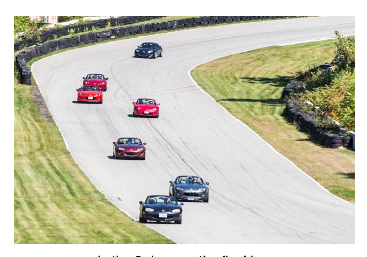
In the 3rd car on the final lap