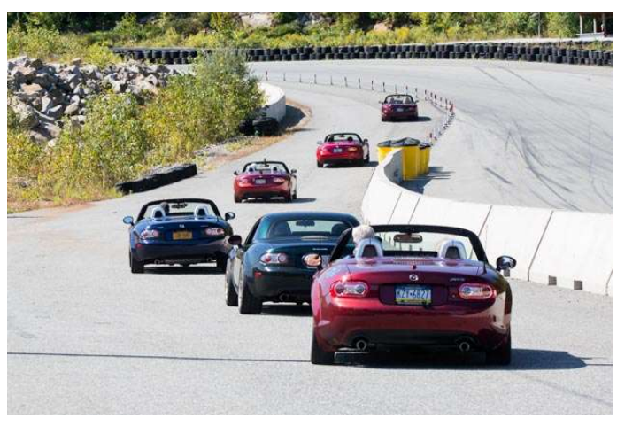
Linda & Joe in the 6th car - 6 cars went out each time